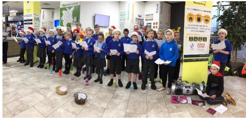
The choir at the Co-op

KS1 start handwriting at 8.50am and KS2 start their morning activities at 8.40am.