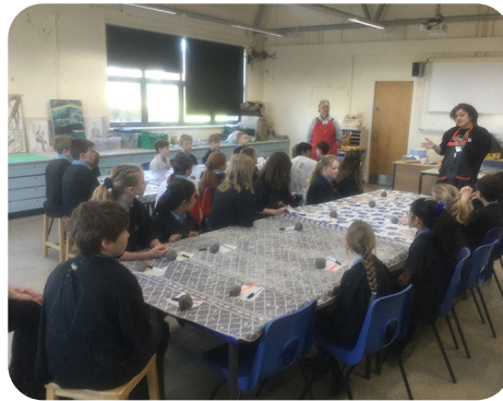
Year 4 Pottery Workshop